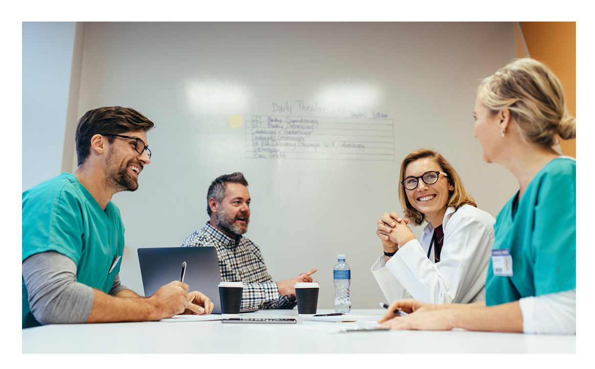
By Elizabeth Woodcock, MBA, FACMPE, CPC

Labor shortages are creating havoc for many businesses in the United States, and medical practices are not immune. Although there may be some relief when the federal government's bonus checks end this fall, the problem will not come to a screeching halt. Indeed, experts believe that the growth of the ambulatory sector – 22,000 of the 23,000 jobs added in health care in May alone -- will propel even more challenges. Moreover, the workload burden has been unrelenting, causing some employees to migrate out of healthcare altogether to other, less stressful – and often higher-paying jobs. Regardless of how you slice it, the labor shortage is a reality.