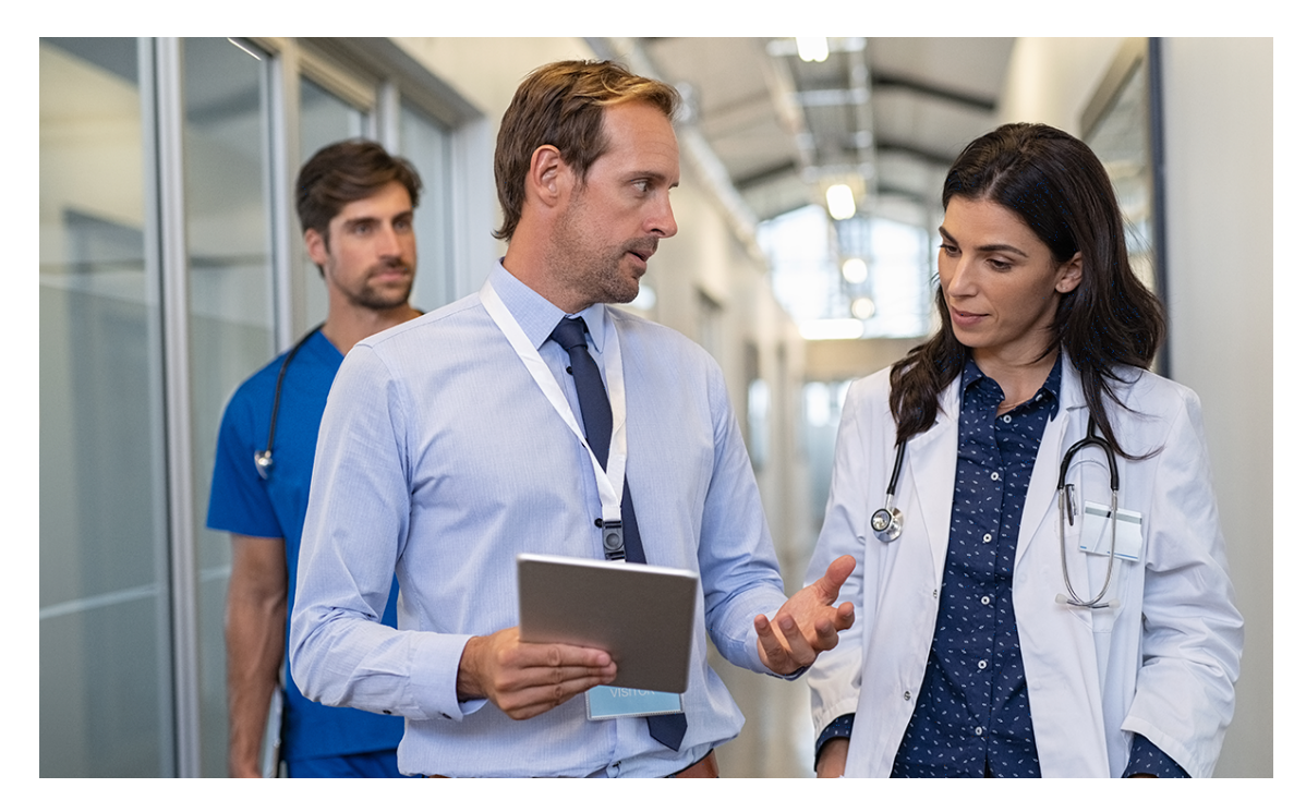
By J. Baugh, JD, CPA

"The single biggest problem with communication is the illusion that it has taken place."