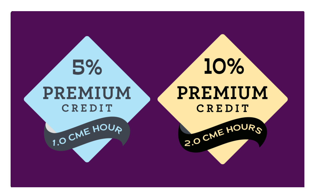
By Shelly Weatherly, JD

SVMIC is pleased to announce that beginning in January 2022, we are offering e-learning courses that provide 5% premium credit and 1 hour of CME (in addition to our traditional 10% premium credit/2-hour CME courses, which will still be offered). These easy-to-digest courses, being offered in response to policyholder requests for more diverse risk education options, will provide a greater variety of current and relevant risk topics.