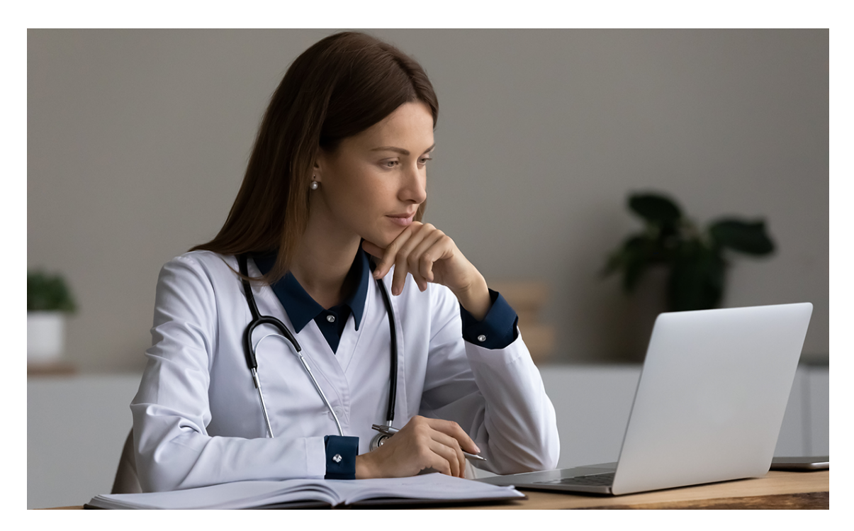
By Jeffrey A. Woods, JD

At SVMIC, we stress the importance of accurate and timely documentation and for good reason – in the event of a claim or lawsuit, the medical record will be the most important piece of physical evidence. But, just as important as what to include in the medical record is what <u>not</u> to include.